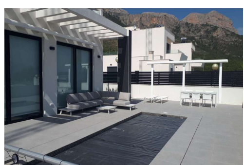
This 3 Bedroom, 2 bathroom villa is located Polop next to La Nucía and Polop de la Marina and only 10 minutes from the beach.Private 3 x 7m Swimming Pool.Outside BBQ areaOutdoor terrace Solarium: 400m2 Plot100m2 BuildElectric Entrance GateOff Road ParkingPre-installation of Air conditioning