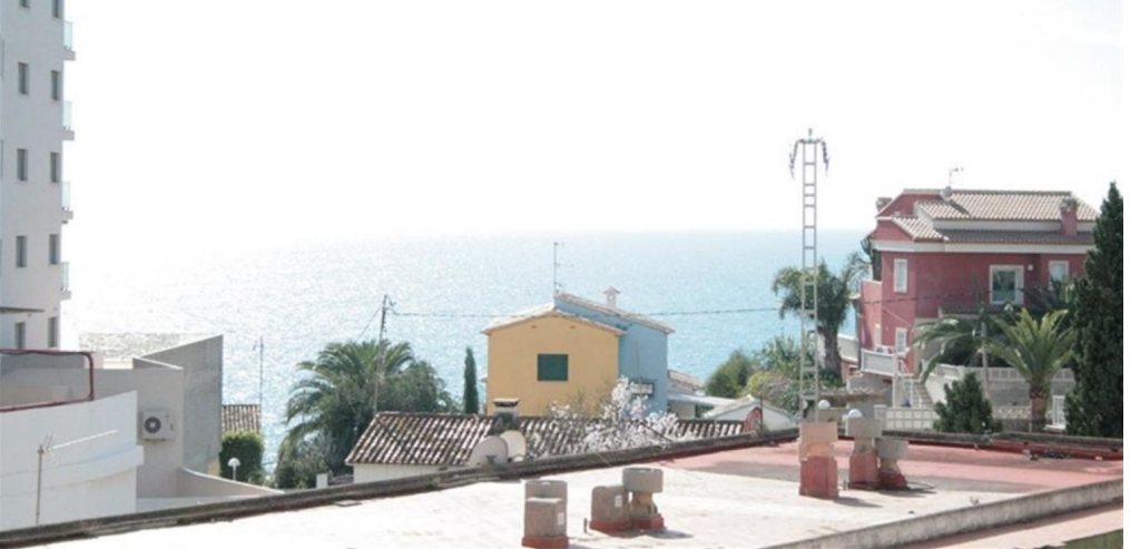
Cozy apartment located 130m from the sea in a quiet area close to all services. It has partial sea views. It consists of 2 bedrooms, bathroom, living room, kitchen and terrace. It sold fully furnished. Equipped with air conditioning.