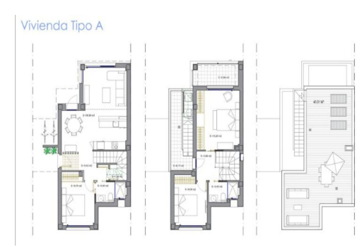
Vivienda Tipo A2